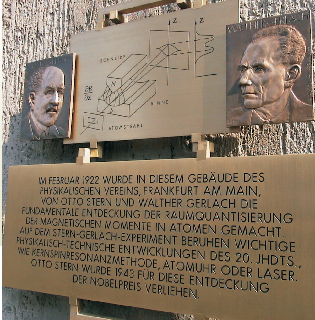
Figure 1. A memorial plaque honoring Otto Stern and Walther Gerlach, mounted in February 2002 near the entrance to the building in Frankfurt, Germany, where their experiment took place. The inscription, in translation, reads: “In February 1922 . . . was made the fundamental discovery of space quantization of the magnetic moments of atoms. The Stern–Gerlach experiment is the basis of important scientific and technological developments in the 20th century, such as nuclear magnetic resonance, atomic clocks, or lasers. . . .” The new Stern–Gerlach Center for Experimental Physics at the University of Frankfurt is under construction about 8 km north of the original laboratory.

with his student Elisabeth Borman, to measure the mean free path for a beam of silver atoms attenuated by air. In Stern’s first beam experiment, reported in 1920 and motivated by kinetic theory, he determined the mean thermal velocity of silver atoms in a clever way. He mounted the atomic beam source on a rotating platform—a miniature merry-go-round—that spun at a modest peripheral velocity, only 15 meters per second. That produced a small centrifugal displacement of the beam indicative of its velocity distribution as imaged by faint deposits of silver. From the shift of those deposits, caused by reversing the direction of rotation, Stern was able to evaluate the far larger mean velocity of the atoms—about 660 m/s at 1000°C. Soon thereafter, his design for the SGE would invoke an analogue to test the Bohr model: A magnetic field gradient should produce opposite deflections of the beam atoms, according as the planetary electron rotates clockwise or counterclockwise about the field axis.