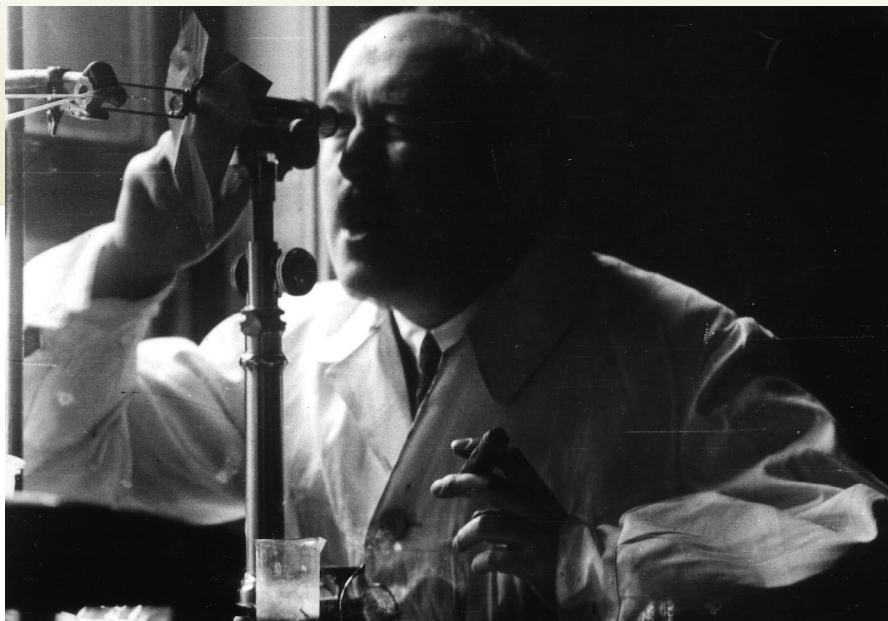
Figure 2. Otto Stern (1888–1969), cigar in hand, working in his molecular beam laboratory at the Institute for Physical Chemistry in Hamburg, about 1930.

Copenhagen said to me in a friendly manner, “You look very unhappy,” whereupon I answered fiercely, “How can one look happy when he is thinking of the anomalous Zeeman effect?” 6